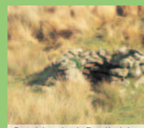
Beehive hut, Postbridge

They are associated with both industrial and agricultural activities. The ruins of blowing houses, where tin ore was crushed and smelted, may be encountered. Here may be seen the remains of the pit where a waterwheel stood, the hollowed-out granite mortarstone on which the ore was crushed, or the mouldstones for making ingots.