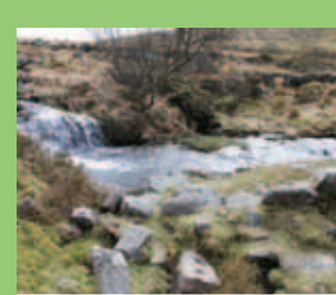
Blowing house, Black Tor